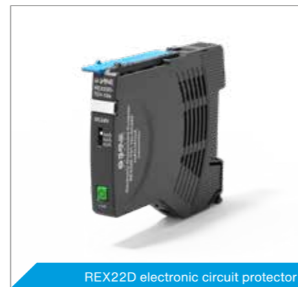
REX22D electronic circuit protector